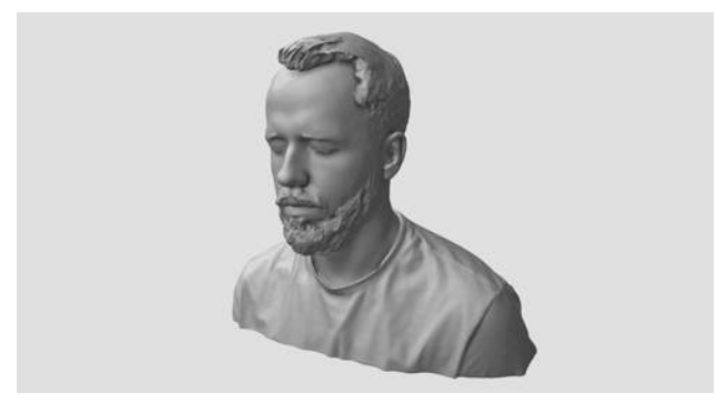
Statues, and the human body