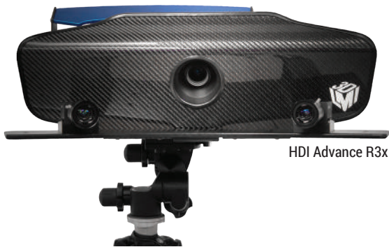
HDI Advance R3x

The HDI Advance Macro Scanner Kit is an add-on accessory to the HDI Advance R3x for scanning extremely small objects such as tips of syringes, screws and bolts, and small insects with high precision accuracy.